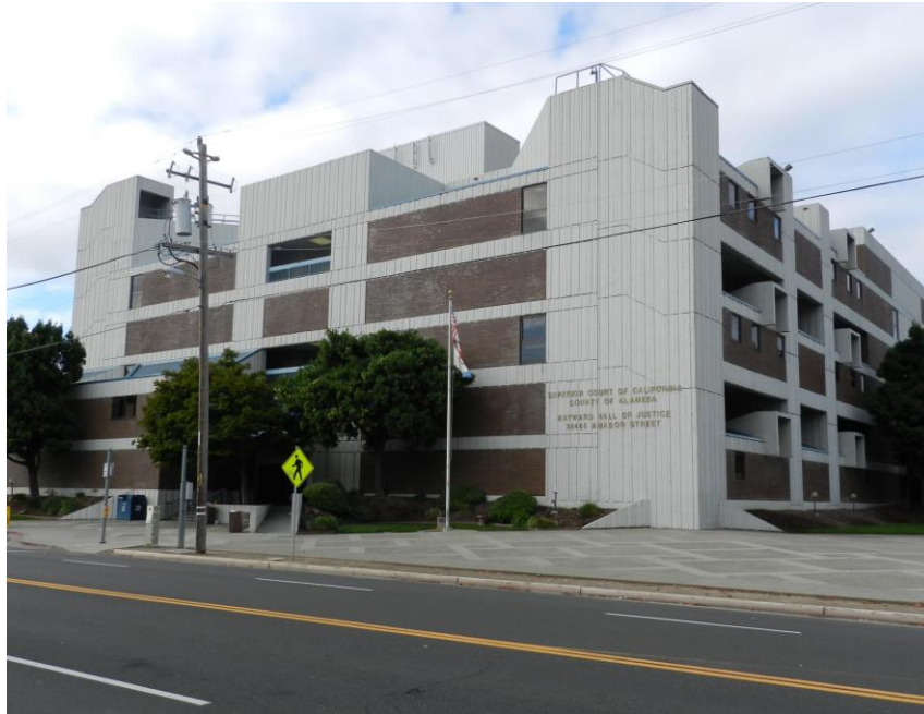
Hayward Hall of Justice 24405 Amador Street, Hayward, CA 94544