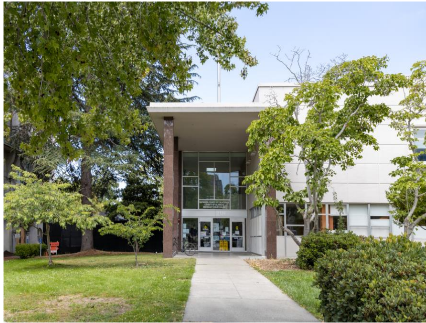
Berkeley Courthouse 2120 Martin Luther King, Jr. Way, Berkeley, CA 94704