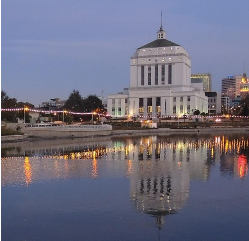
Rene C. Davidson Courthouse 1225 Fallon Street, Oakland, CA 94612